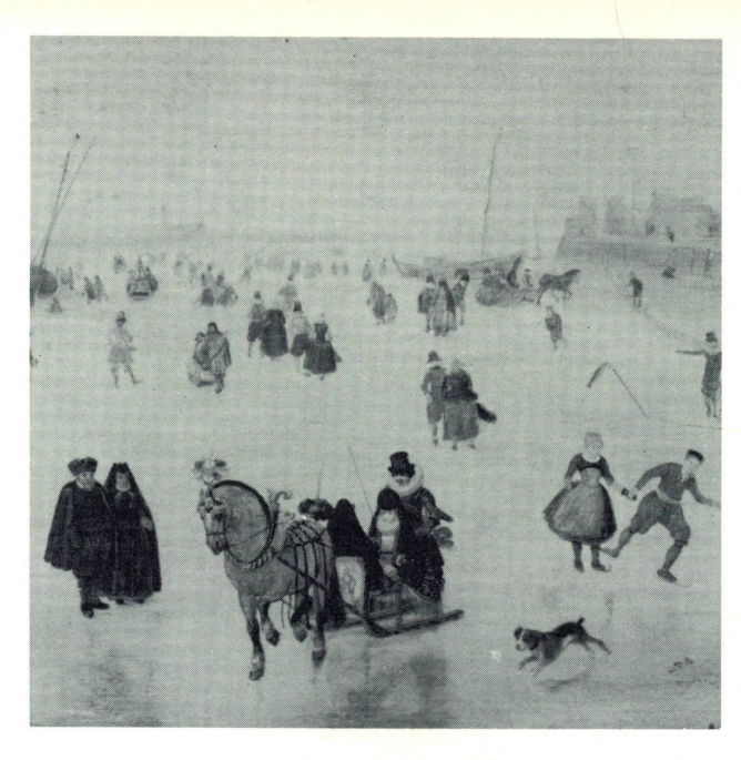
AVERCAMP. A Scene on the Ice (detail)

Inquiries concerning the Gallery's educational services should be addressed to the Educational Office or telephoned to 737-4215, ext. 272.