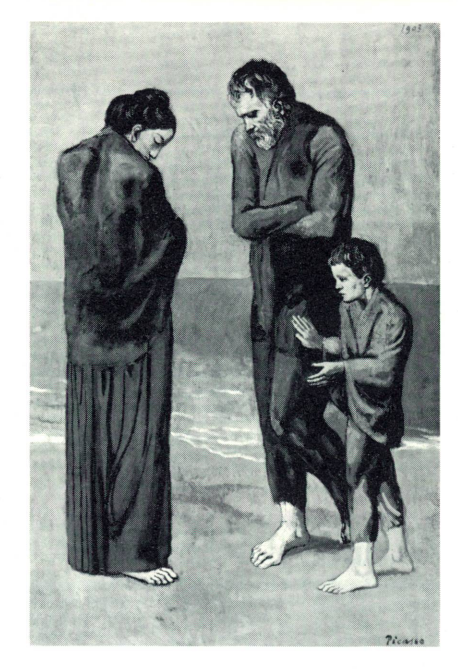
Picasso. The Tragedy

All concerts, with intermission talks by members of the National Gallery Staff, are broadcast by Station WGMS-AM (570) and FM (103.5).