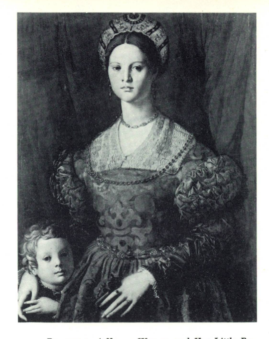
Bronzino. A Young Woman and Her Little Boy