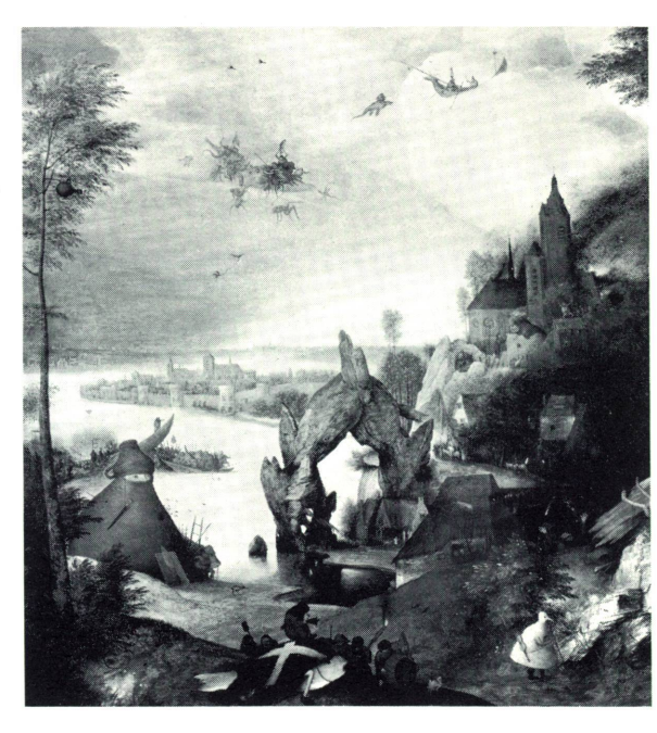
PIETER BRUEGEL THE ELDER. The Temptation of Saint Anthony (detail)