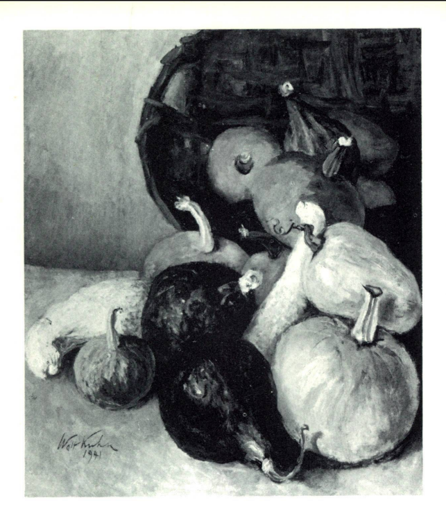
WALT KUHN. Pumpkins (detail)