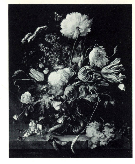
JAN DAVIDSZ. DE HEEM. Vase of Flowers

MONDAY, July 29, through SUNDAY, August 4