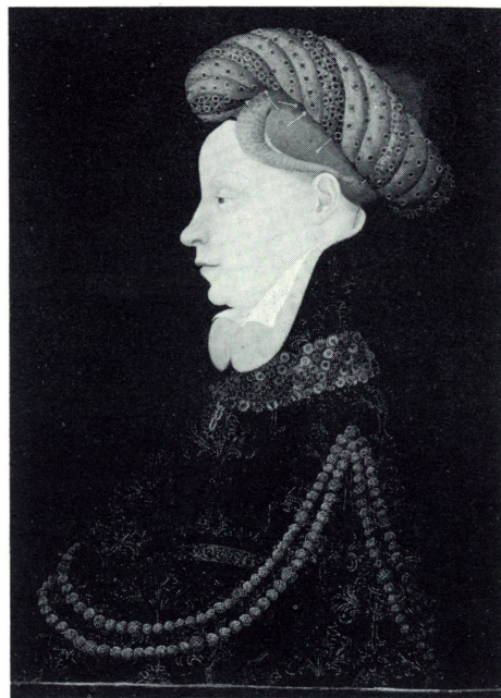
FRANCO-FLEMISH SCHOOL, EARLY XV CENTURY. Profile Portrait of a Lady