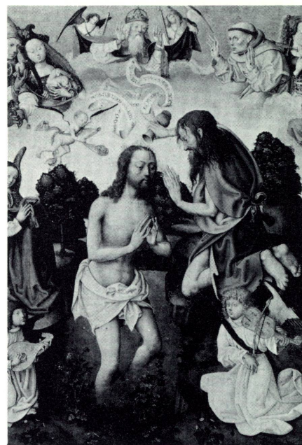
MASTER OF THE SAINT BARTHOLOMEW ALTAR. The Baptism of Christ (detail)

Weekdays, Luncheon 11:00 a.m. to 2:30 p.m.; Snack Service 2:30 p.m. to 5:00 p.m.; Dinner 5:00 p.m. to 8:00 p.m. Sundays, Dinner 12 noon to 7:30 p.m.