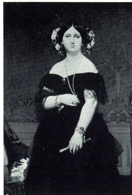
INGRES. Madame Moitessier