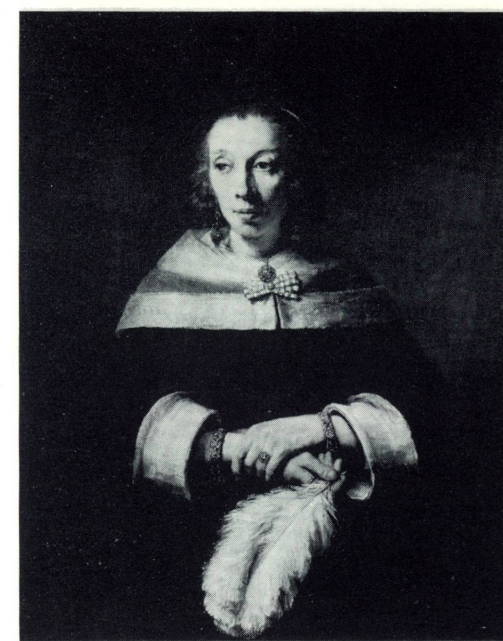
REMBRANDT. Portrait of a Lady with an Ostrich-Feather Fan