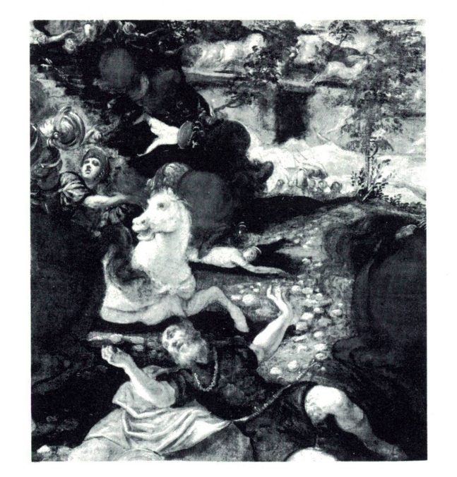
TINTORETTO. The Conversion of Saint Paul (detail)