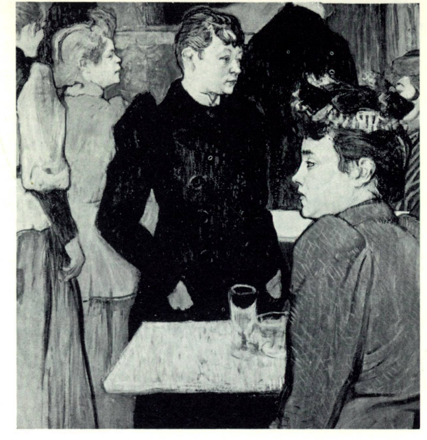
Toulouse-Lautrec. A Corner of the Moulin de la Galette (detail)