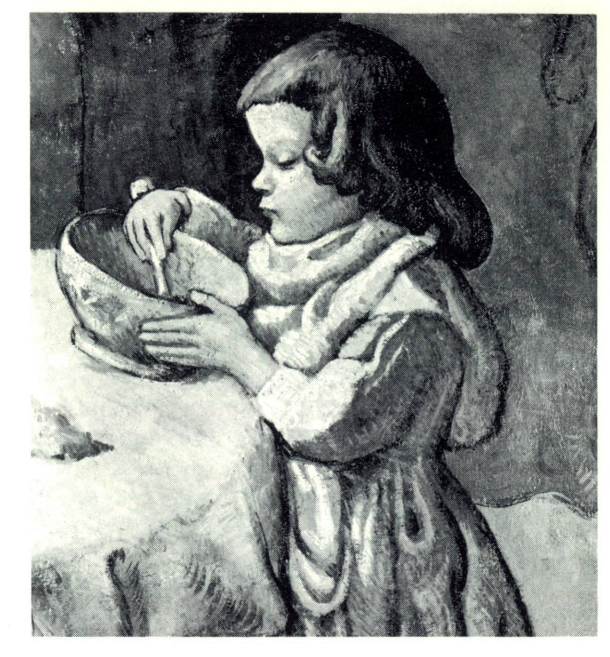
Picasso. Le Gourmet (detail)