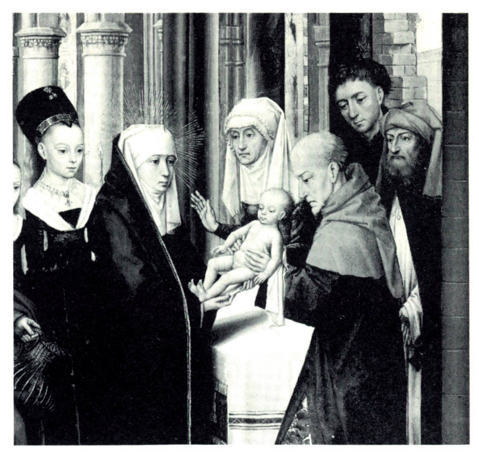
Memling. The Presentation in the Temple (detail)