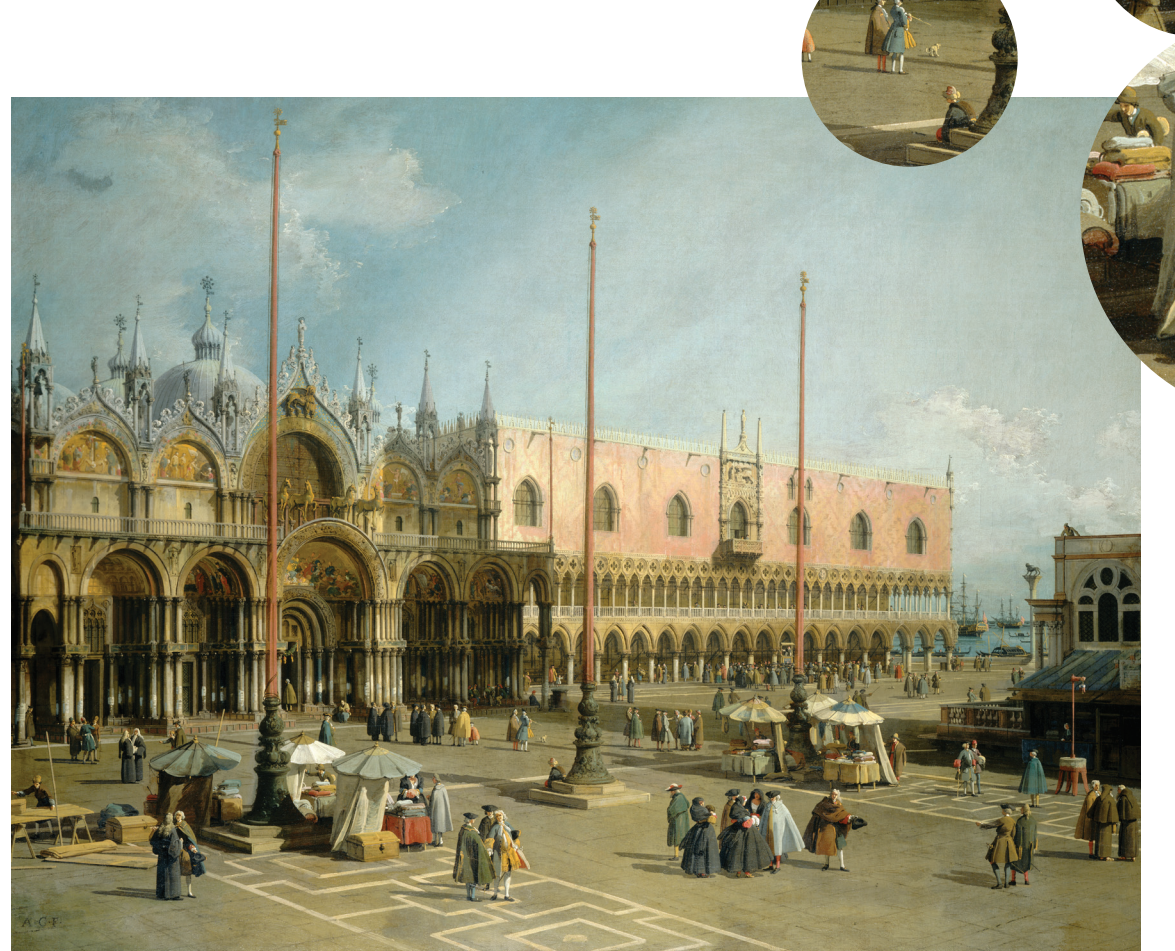
Canaletto, The Square of Saint Mark's, Venice, 1742/1744, oil on canvas, National Gallery of Art, Gift of Mrs. Barbara Hutton

Around three bronze flagpoles, merchants set up tables, take goods out of trunks, and display bolts of cloth at booths protected by umbrellas. These activities, and the ships off in the distance, highlight Venice's role as a center of trade. Canaletto included about two hundred figures in this painting!