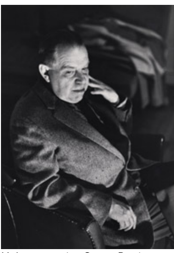
Stuart Davis, 1957, photograph