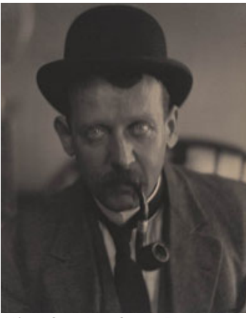
Alfred Stieglitz, Oscar Bluemner , 1913, platinum print, National Gallery of Art, Washington, Alfred Stieglitz Collection