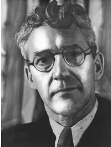
John Sloan, c. 1930, photograph