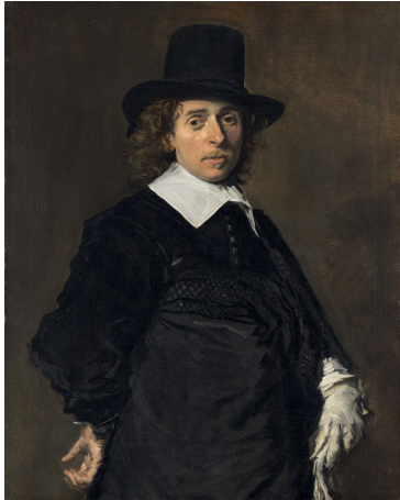
Frans Hals, Adriaen van Ostade , 1646/1648, oil on canvas, National Gallery of Art, Washington, Andrew W. Mellon Collection, 1937.1.70