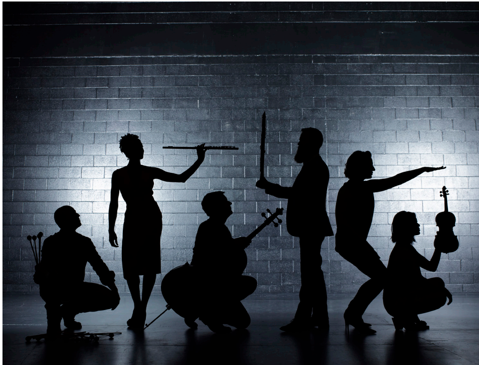
Eighth Blackbird