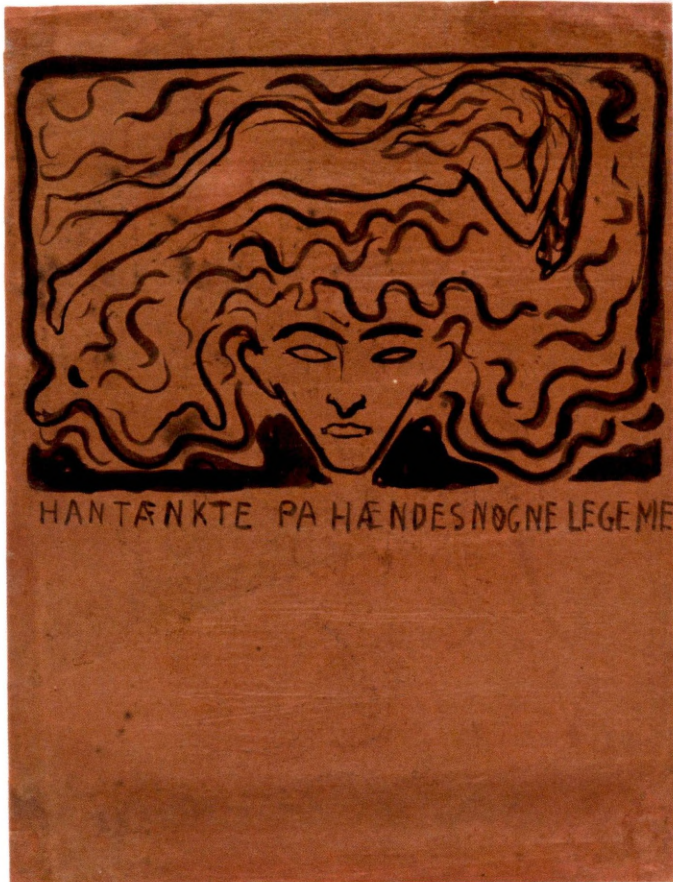
Edvard Munch, In Man's Brain (Head) , c. 1897. National Gallery of Art, Washington, Epstein Family Fund and the Director's Discretionary Fund