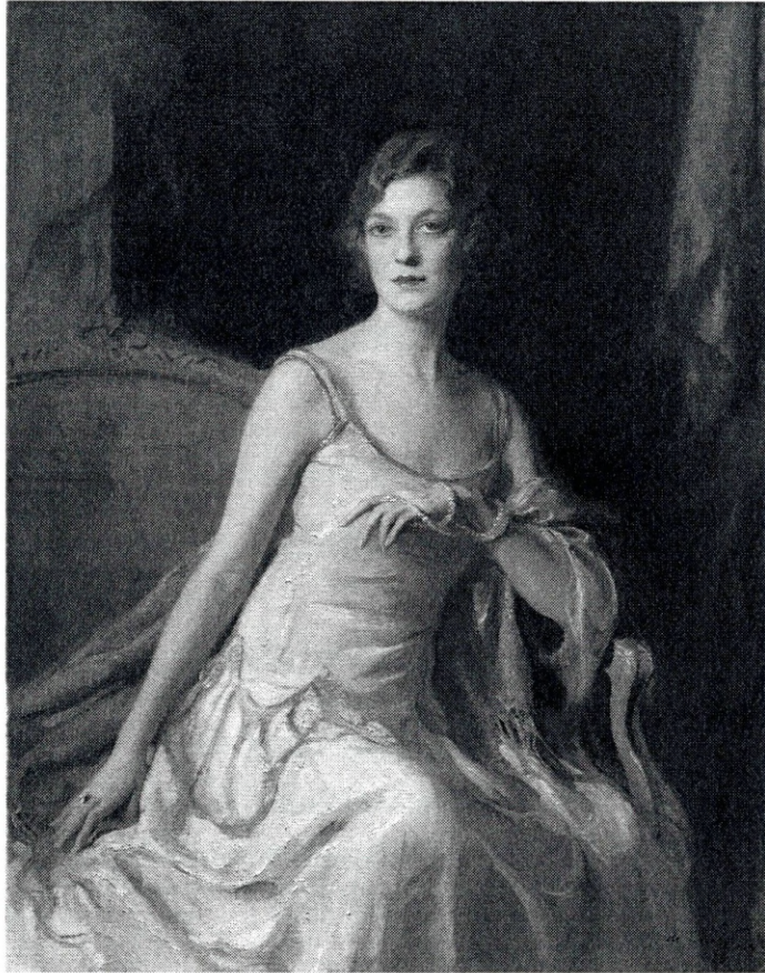
Philip Alexius de Laszlo, Ailsa Mellon Bruce , 1926. National Gallery of Art, Washington